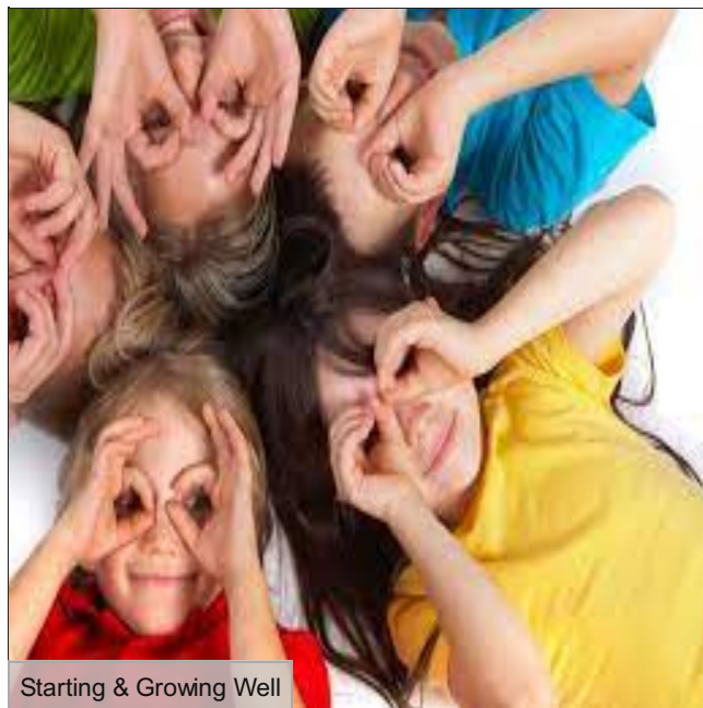
Starting & Growing Well