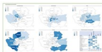
Breakdown of the resident population of each of the five York PCNs, by ward to aid with service planning