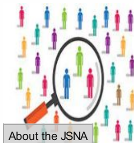
About the JSNA