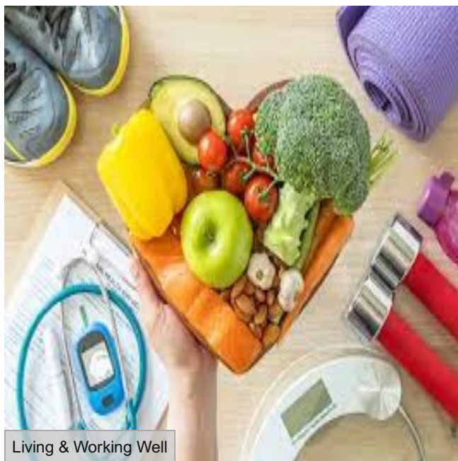
Living & Working Well